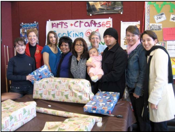
Above, Vision Literacy staff observe the season of giving by wrapping donated presents for local children in need

The staff of Vision Literacy wish you a wonderful 2009. We look forward to working with you throughout the year!