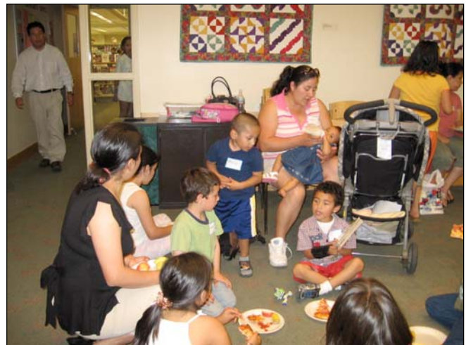
Families enjoy dinner together as part of the Prime Time program at the Mountain View Public Library